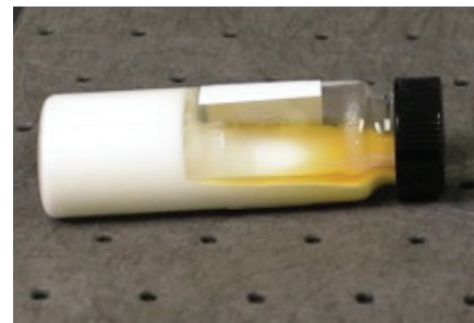
600 SC Standard

Some separation and precipitation observed.