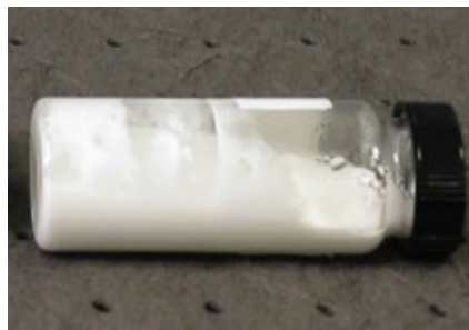
200 SC Standard

No separation or precipitation in the formulation.