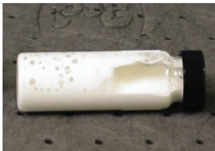
Contrado® 200 SC

Quali-Pro is committed to providing the highest quality products, from innovative active ingredients to superior formulation types. No product advances in development unless the formulation meets or exceeds the quality and performance of the competitive benchmark. Contrado SC is no exception! With many chlorantraniliprole options on the market, what sets them apart?